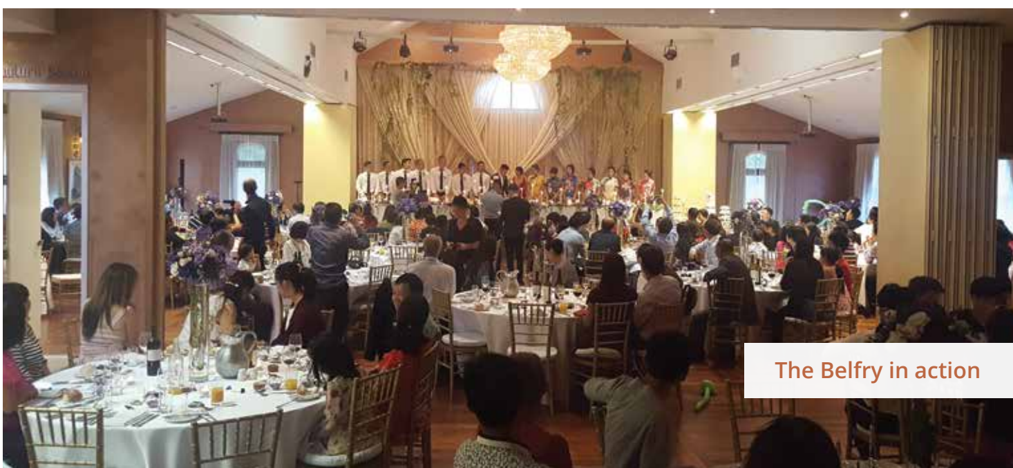
The Belfry in action