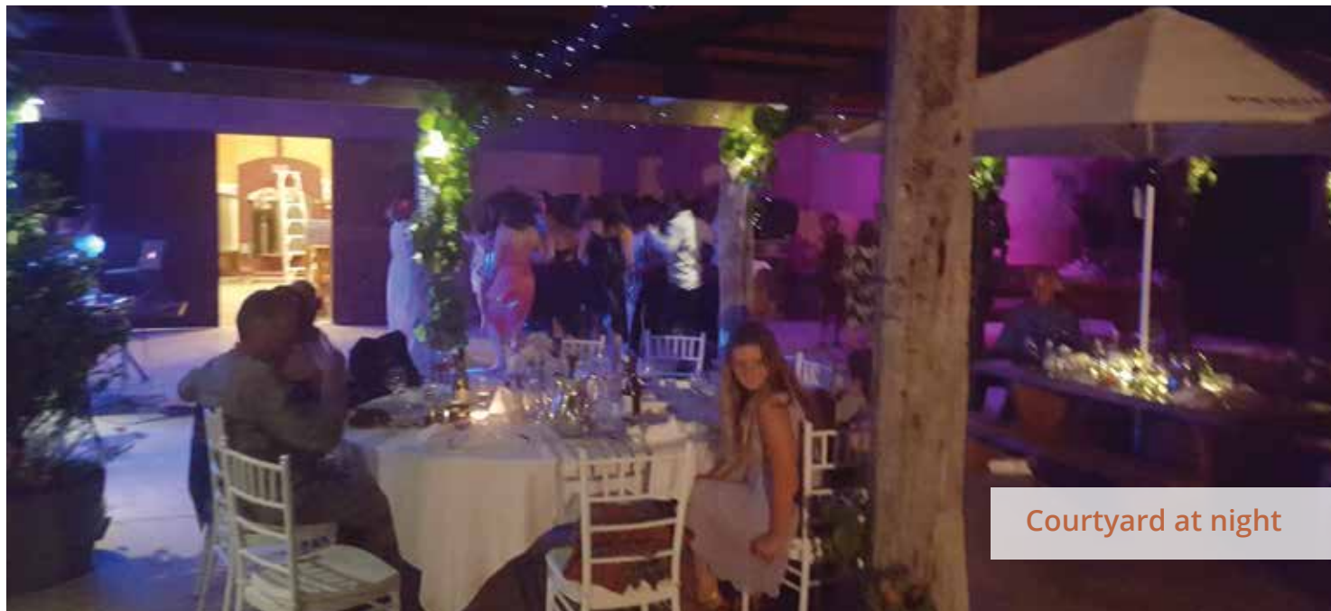
Courtyard at night

For a full selection of images please visit our gallery at www.ascensionwine.co.nz